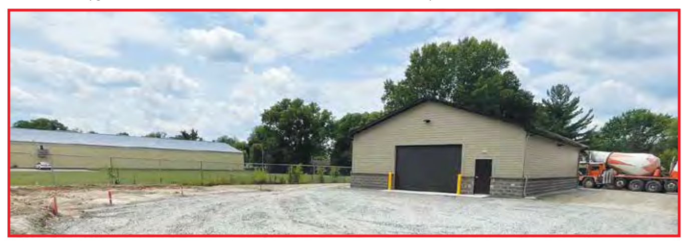
Ashwaubomay Park Maintenance Storage Building