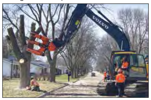
A rubber tracked excavator equipped with a special cutting shear moves the trunk of an ash on Orchid Lane.