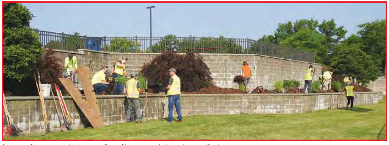
Stantec Community Volunteer Day Cleanup at Ashwaubomay Park