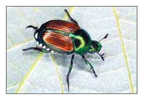
Adult Japanese beetle

oth adult and the grub stage of Japanese beetles cause serious damage to many landscape plants (more than 320 species) and turf grasses. The adult beetles skeletonize the leaves by chewing between the veins of the leaf tissues, devour the flowers (roses) and fruits (raspberries), and ultimately weaken the plant. Roses, birch, linden, grapes, raspberries, Norway maples, beans, apples, plum, crabapples, elms, beech, asparagus and rhubarb are some of its favorite delicacies.