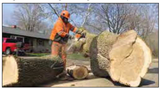
A crew member cuts a large diameter log into manageable sized pieces.

Large diameter logs waiting to be transported to a holding yard.