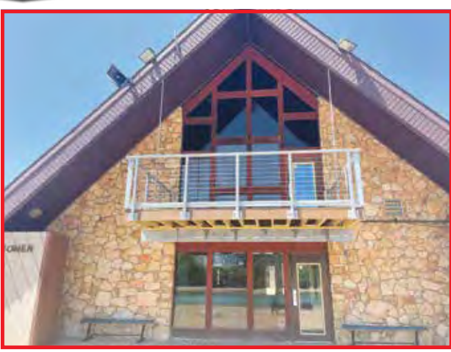
Ashwaubomay Lake Chalet Deck