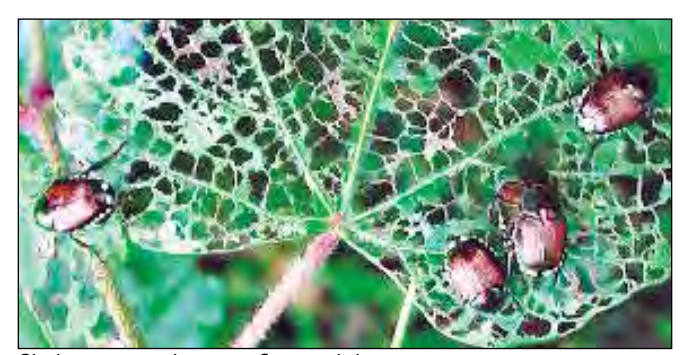
Skeletonizing damage from adults

Control options for adult Japanese beetles and their grubs vary depending on the landscape plants. No treatment is needed for mature trees and shrubs because they have more tolerance to the feeding damage caused by the adults and will leaf out again the next year.